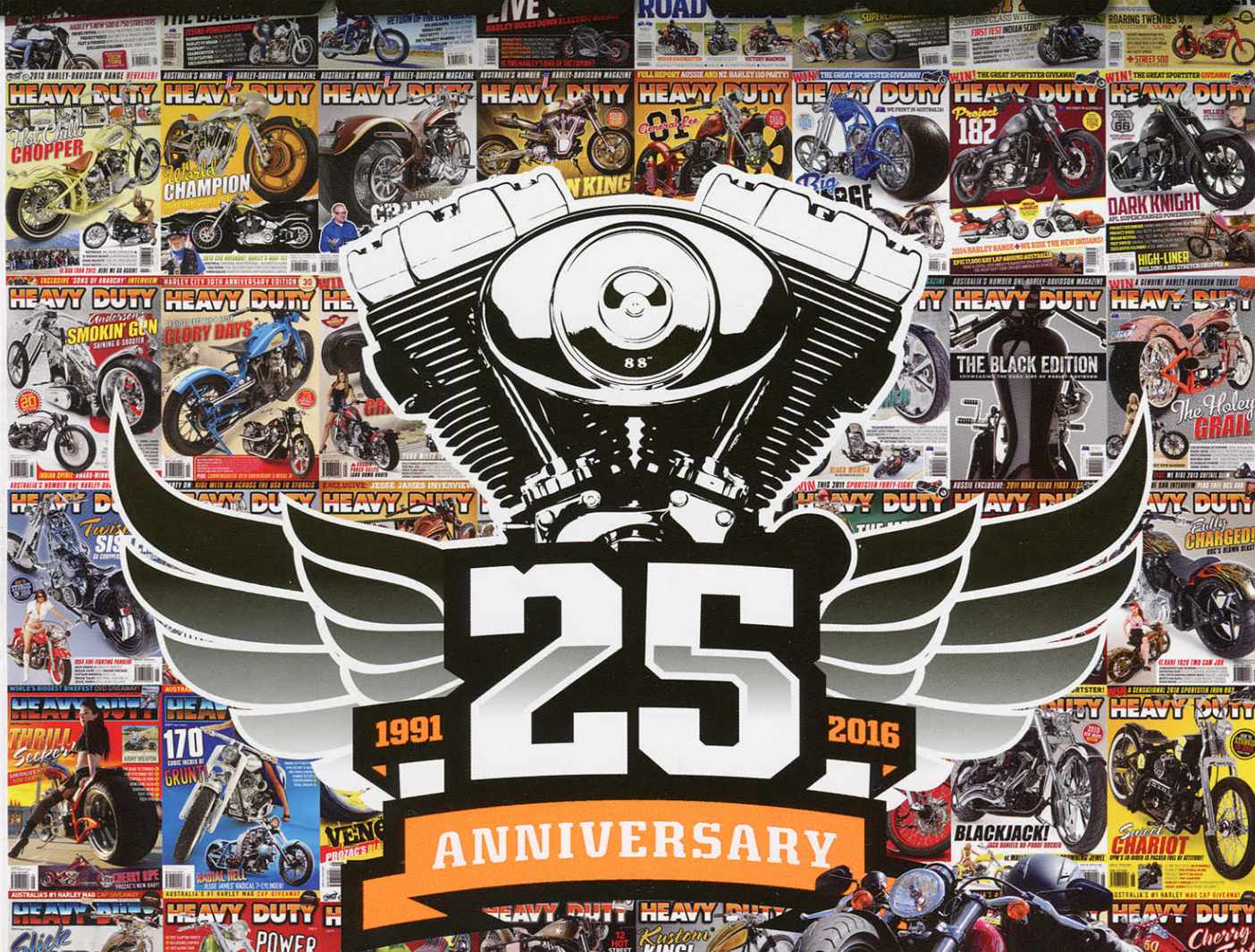
As seen in Heavy Duty Issue 148 Sept/Oct 2016. Page 25.