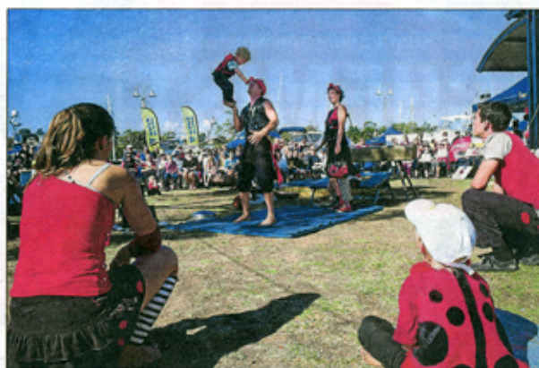
The Sands Family Circus performing at Seafest at Triabunna.